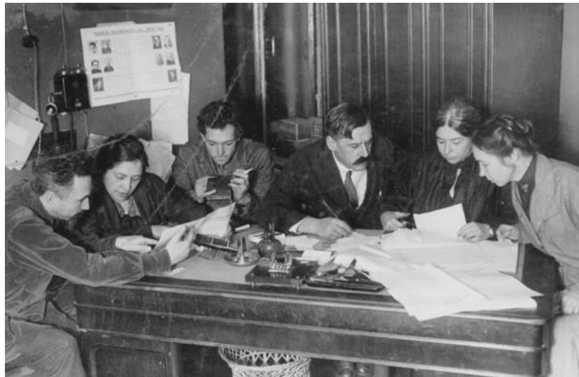
Soviet teachers of the 1920s

Solution to the problem: the young man becomes a pioneer after overcoming all the obstacles.