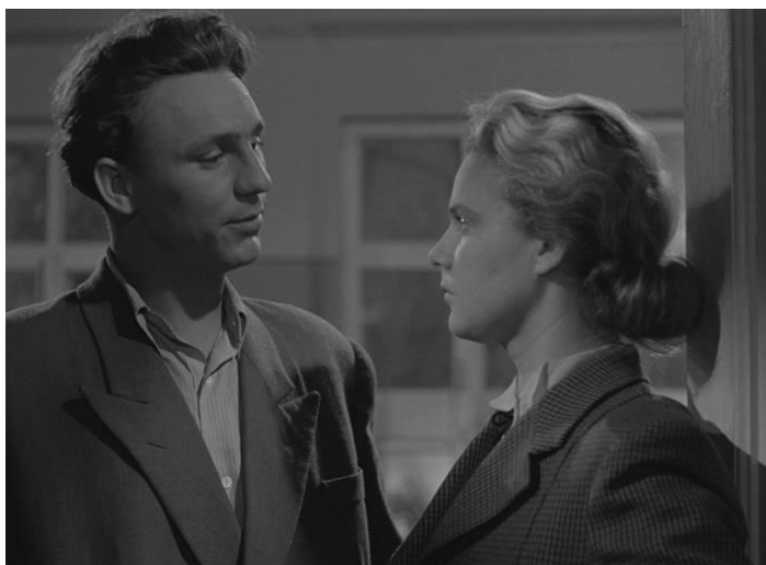
A shot from the movie Spring in the Riverside Street (1956)