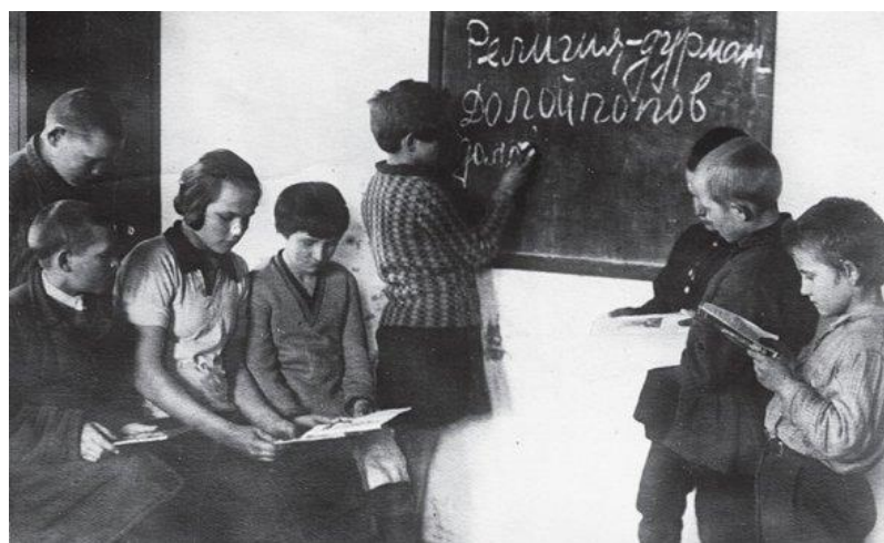
Soviet school students of the 1920-s at the lesson

Photos of the 1920s give us a glimpse of the appearance, clothes and constitution of Soviet school students and teachers of that time.