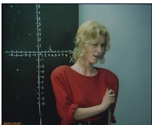
Young teacher: a shot from the movie The Doll (1988)

Schoolchildren in the films 1986–1991, unlike the "thaw" and "stagnation" periods, have a rather pragmatic life vision, related to material prosperity, or, on the contrary, are in deep depression. Screen teachers often put up with the idea that it is impossible to reform a "bad" student. Perestroika period teachers are even more melancholic than in the films of stagnation period. The professional distance between them and the students becomes even more fragile (that is vividly illustrated in such films as Come What May , 1986; Temptation , 1987; Work on Mistakes , 1988; The Doll , 1988; Dear Elena Sergeevna , 1988; Avaria- a cop's daughter , 1989; Homo Novus , 1990). Like in films during stagnation period, some screen faculty wear rather casual clothes.