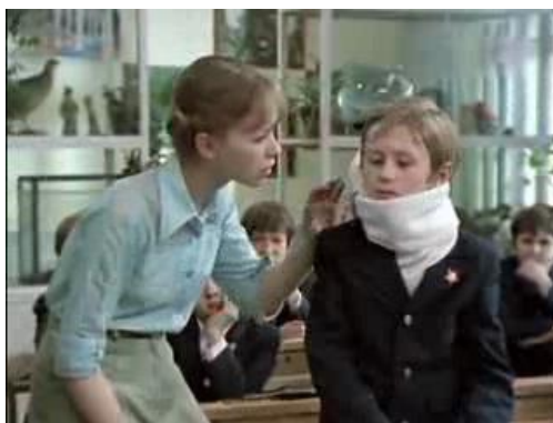
A shot from the movie Quiet C-Students (1980)

Teachers from the films of the stagnation period, like in the days of the late thaw, were increasingly confronted with doubts and sad contemplations. The distance between them and the students became more fragile (this was especially evident in the dramas Other People's Letters , Traitor , Alyosha , 4:0 in Tanechka's favor , Good Intentions , Almost Peers ). As for the appearance, now they could already afford some liberties in their clothes (for example, a suede jacket, a flirty scarf, in-style blouse and hairdo).