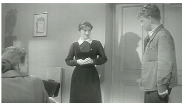
A shot from the movie What if it's love? (1961)

A shot from the movie What if it's love? (1961) gives a good idea of the appearance, clothes, physique of characters – schoolchildren.