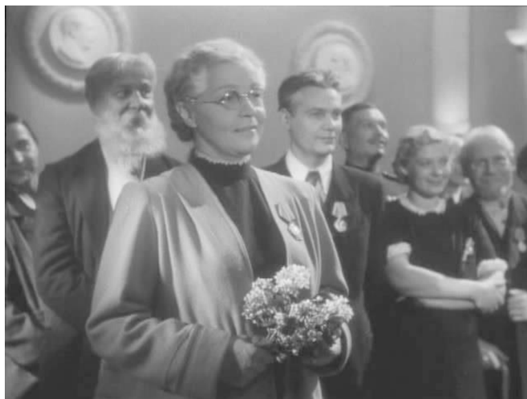
A frame from the film The Village Teacher (1947)

This film frame from the film The Village Teacher (1947) gives a good glimpse of the characters’ – school teachers’ – looks, clothes, and constitution.