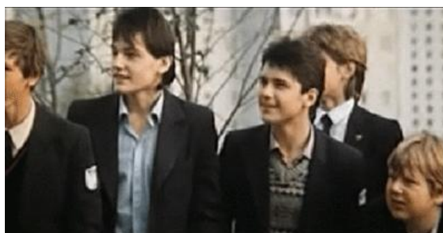
Students: a shot from the movie A Slap in the Face, That Never Happened (1987)

- appearance, clothing, physique of characters, features of their characters, vocabulary : the appearance of the characters of school children and students in the films of the perestroika period is within the framework of the canons of the student's image of that time, which was by far more free than in the 1970s.