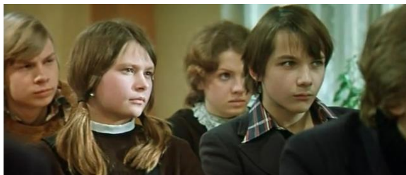
A shot from the movie The Practical Joke (1976)

Schoolchildren in the films 1969-1985, as in the "thaw" period, did not exhibit fanaticism of their peers in the films of the 1920s -1930s, but on the whole they retained optimism. However, more and more often villain characters, who clearly had no chance of reformation, appeared on screen.