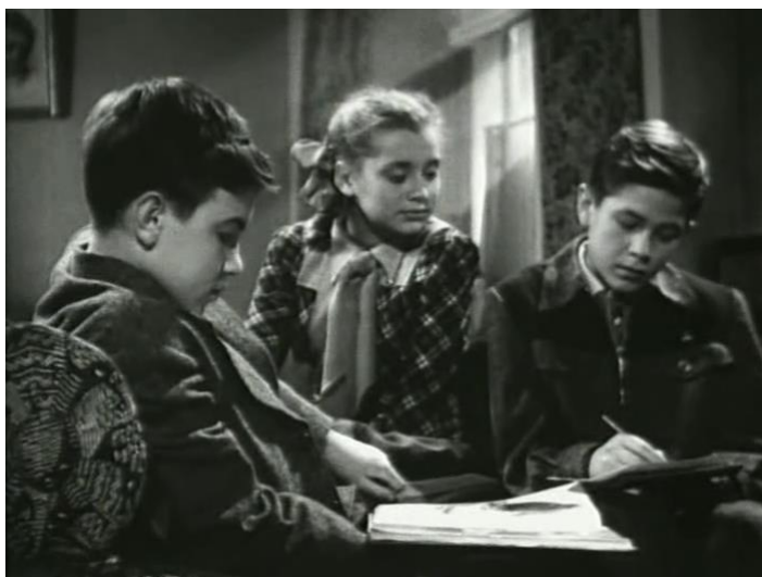
A frame from the film The Red Scarf (1948)

Thus, school students in the films of the 1930s – the first half of the 1950s were mostly motivated, emotional, active, optimistic, brave, balanced, with polite speech (though sometimes rhapsodic), determined to become useful members of the pioneer/komsomol organization, to study well and help the elderly. As for negative characters (boastful, deceitful, etc.), they would always change for the better at the end of the film.